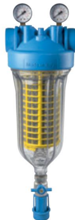
HYDRA BIG Filtration System Self-cleaning Filter Design 50 or 90 Micron

Check out more about Atlas Filtri at us.atlasfiltri.com .